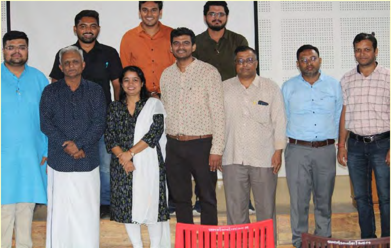
Photograph with Group of Batch 3 during the Event