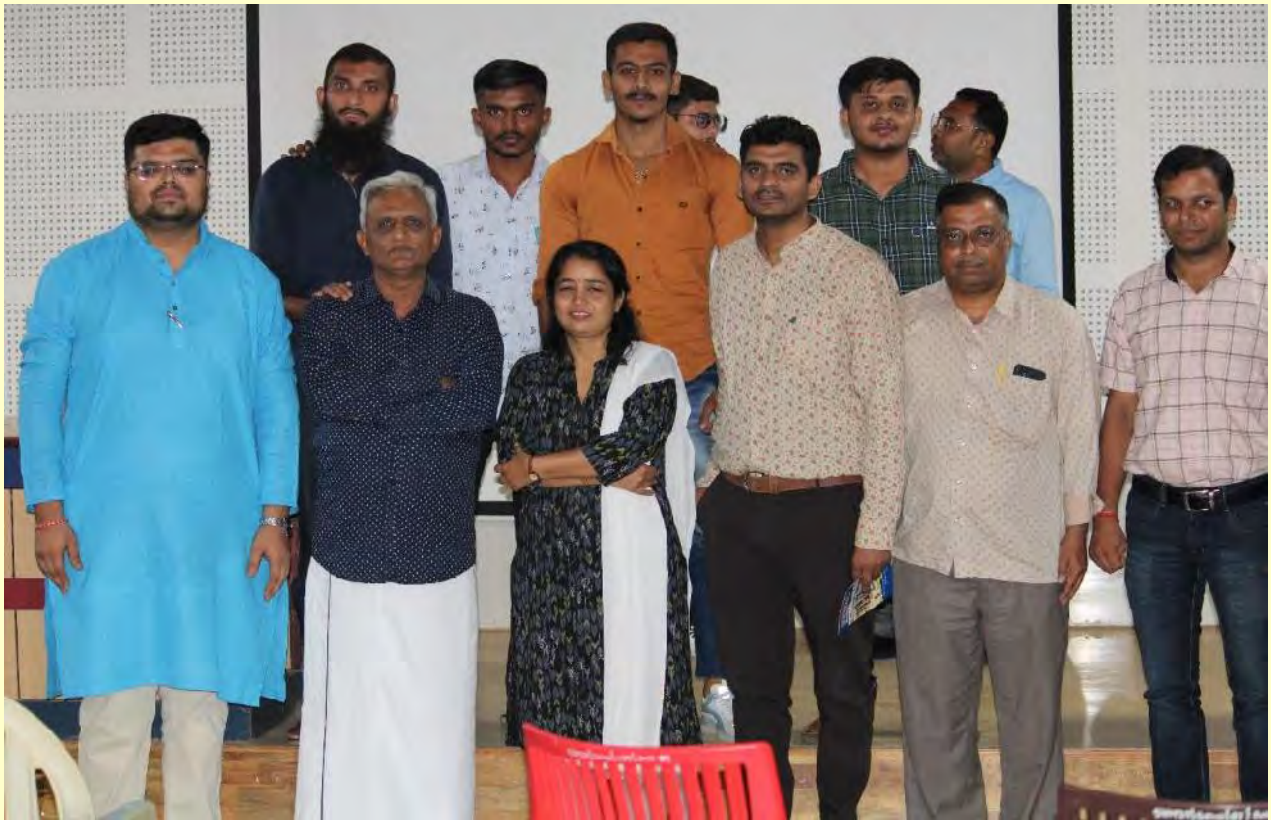
Photograph with Group of Batch 7 during the Event