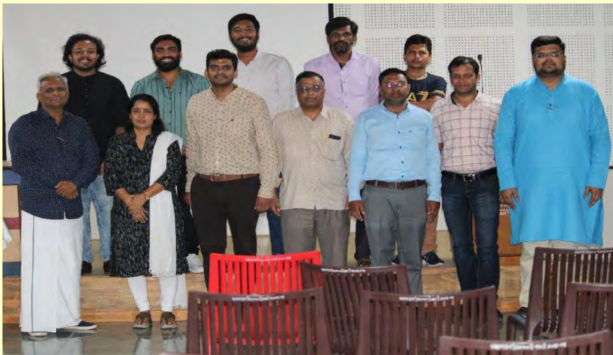
Photograph with Group of Batch 2 during the Event