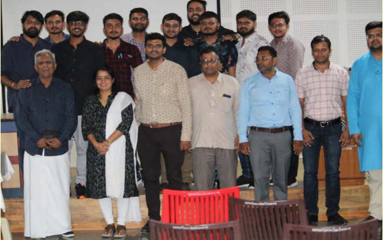
Photograph with Group of Batch 1 during the Event

The following were the few group photographs at the end of the event –