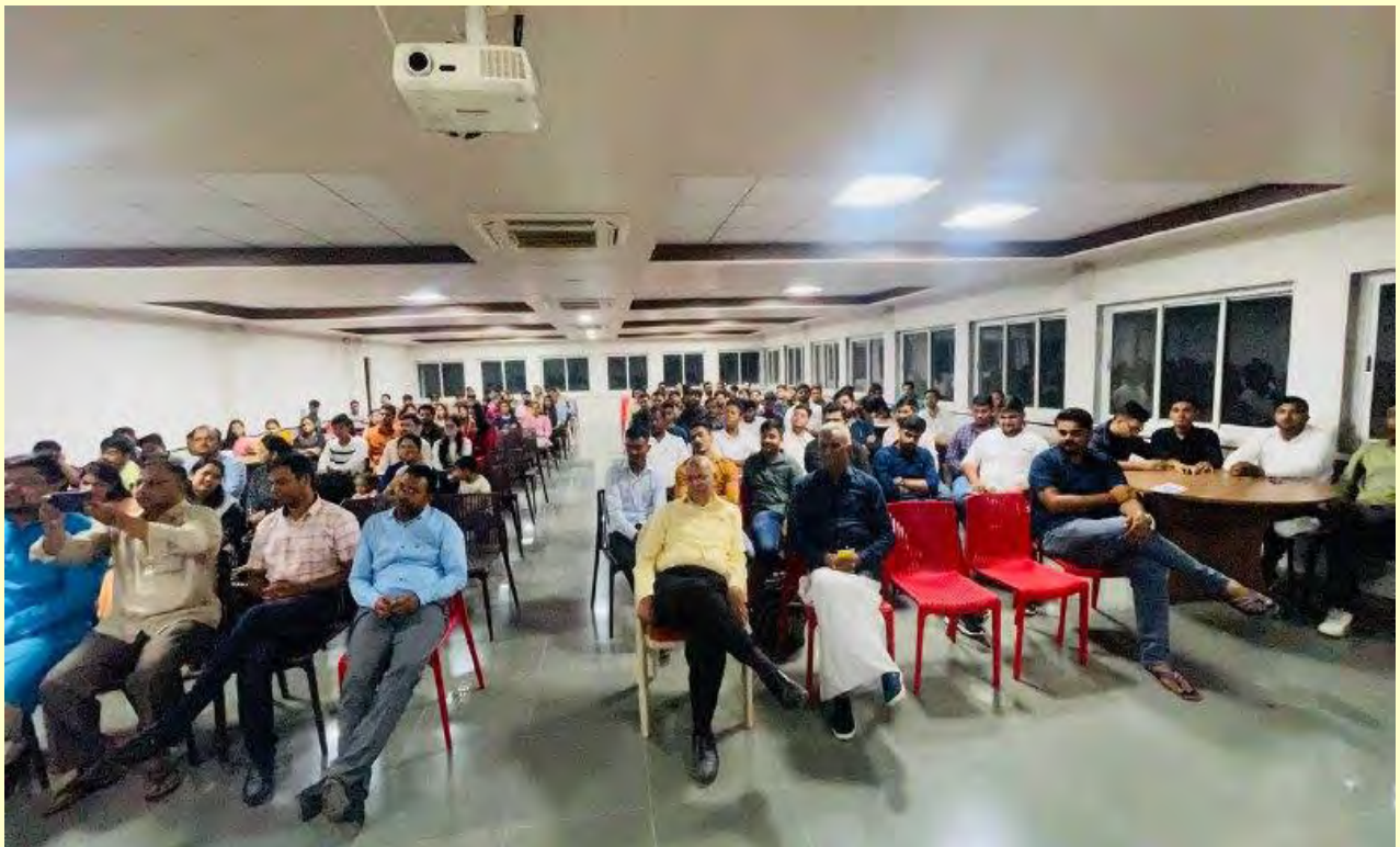
Photo graph during the discussion in the session with students by the Alumni

Around seventy Alumni from total seven pass out batches, present students, staff members of the department, in total 150 people were present in the event