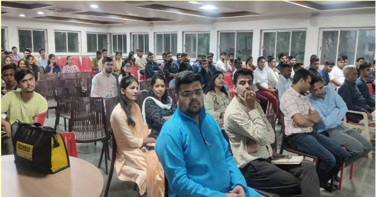
Alumni & Faculty Members of the Department