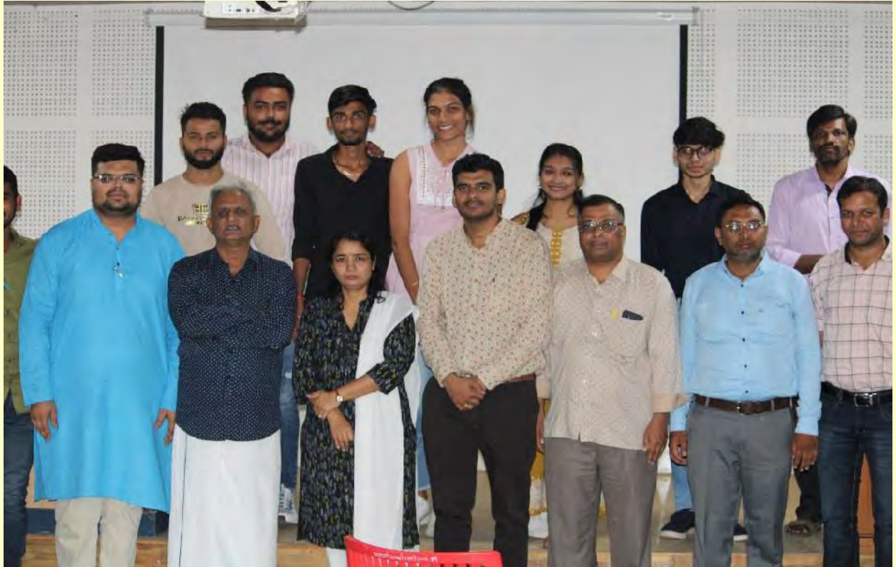
Photograph with Group of Batch 5 during the Event