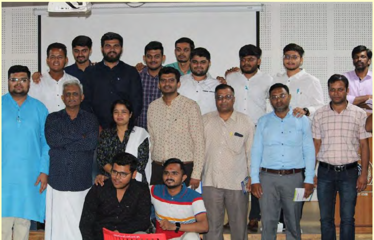
Photograph with Group of Batch 6 during the Event