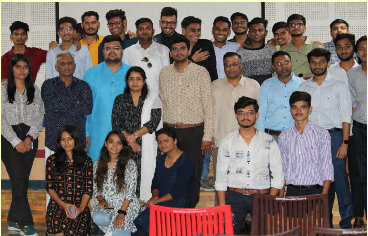
Photograph with Group of current year students during the Event