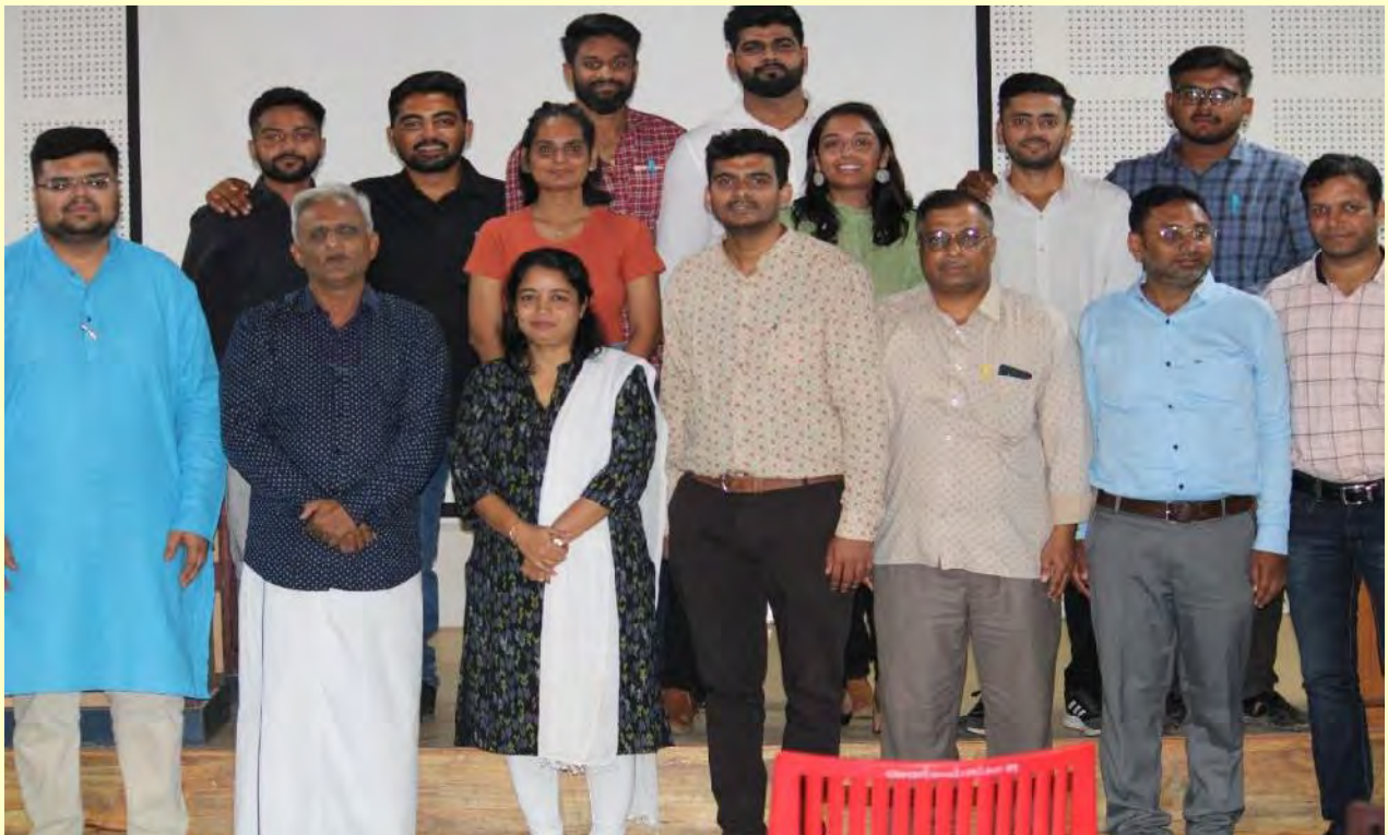
Photograph with Group of Batch 4 during the Event